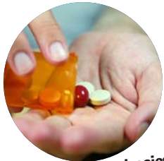
Treatments: The basics

If you are thinking of having a baby, talk to your HIV doctor about it. Your doctor will be able to advise you on: