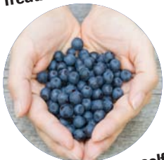
Looking after yourself

If you have a regular partner, it is good to talk about your options together, so you can make decisions that you are both comfortable with.